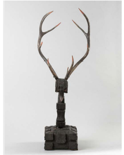
Wood, Paris, Cernuschi museum

The depiction of the deer dates back to the dawn of Chinese art history. In the Kingdom of Chu (central China, 453 – 223 BC), whose culture is known for its affinity with shamanism, we know a production of funerary sculpture – Zhenmushu – the tomb guardian animal. This monstrous creature with a hanging tongue features upturned fangs, a flat nose and large round eyes. The head is surmounted by large deer antlers. Endowed according to the popular imagination with a supernatural power, they were supposed to chase away evil spirits and guarantee the eternal rest of the deceased. They were placed at the entrance of Chinese burial chambers.