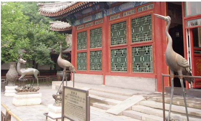
Pair of bronze cranes at the entrance to the Summer Palace Beijing Imperial Garden, China

The crane called red-crowned crane in China because of its vermilion red spot on the head, is also nicknamed crane of the immortals because of its relationship with the eight Immortals, deities of Taoism. Indeed, in Taoist mythology, she carried them on her back, serving as a mount. It is the symbol of longevity and is one of the superstitious emblems that are erected in front of pagodas or in front of the main entrance of houses. In popular tradition, the crane also symbolizes lasting feelings and protection.