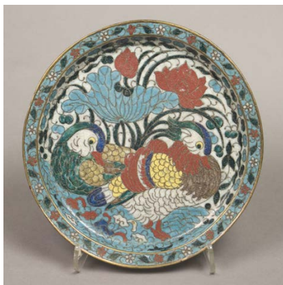
Dish with Mandarin ducks and lotus China, Ming Dynasty XV-XVI centuries Cloisonne enamel Metropolitan Museum, New York