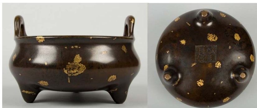
Incense burner in bronze, gold leaf chips