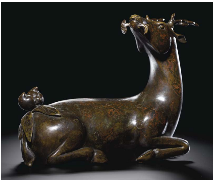
Deer lying with bronze lingzhi Ming Dynasty, Changhua Period, dated 1474 Sale Sotheby's Hong Kong, April 8, 2014, lot 86

We know several representations of deer accompanied by Lingzhi or Reishi – the Asian mushroom with remarkable antioxidant properties to fight against premature aging. In Chinese art the lingzhi symbolizes immortality.