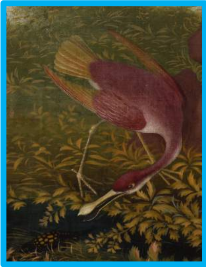
Detail of the spatula from Cayenne Canvas with parrots