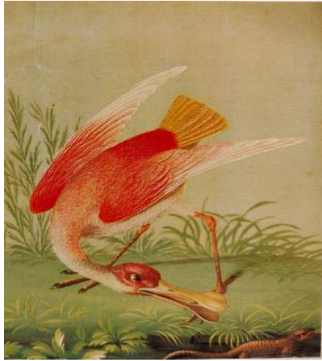
Detail – Set of azure canvasses, circa 1790, Private collection, Milan