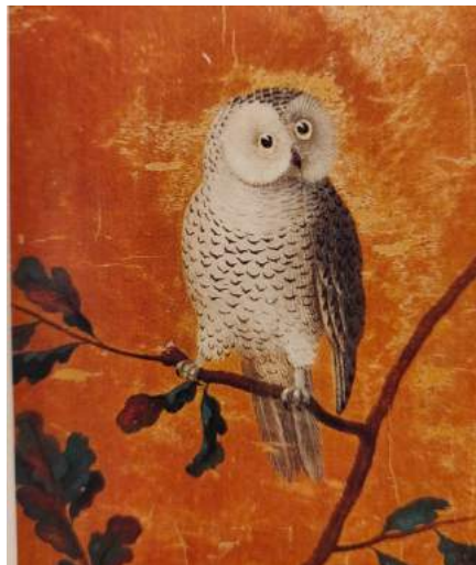
Detail – Cavasses from villa Reale di Monza, circa 1790