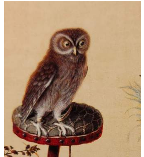
Detail – Set of canvasses on hunting, 1792, Private collection, Milan