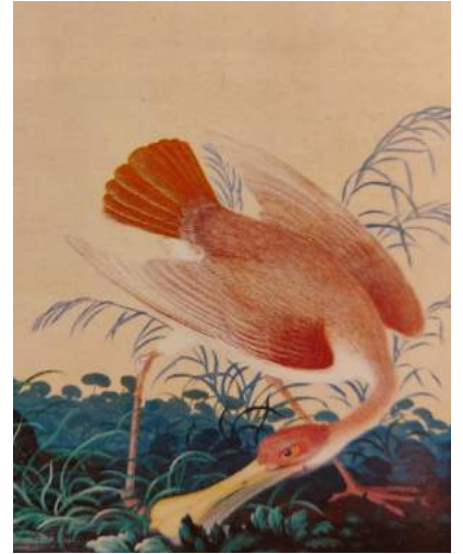
Detail – Set of small canvasses, circa 1790, Private collection, Milan