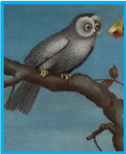
Detail of an owl Canvas with the palm tree