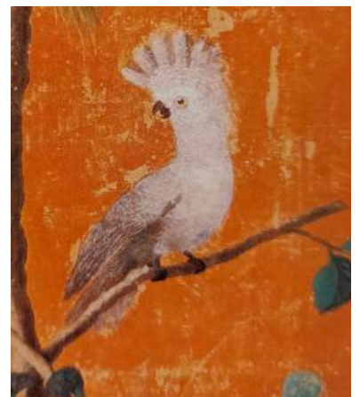
Detail – Cavasses from villa Reale di Monza, circa 1790