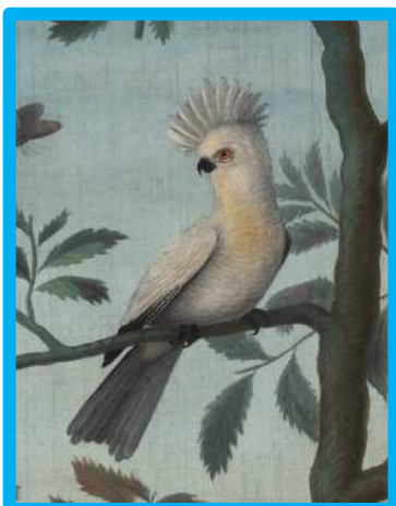
Detail of a Kakatoes from the Moluccas Canvas with parrots